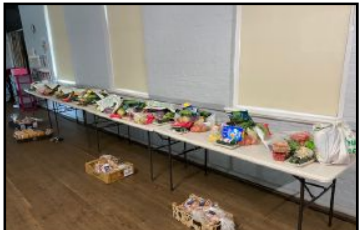
Sorting out OzHarvest delivery ready to make up food parcels