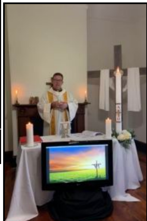
Online Eucharist from the Rectory