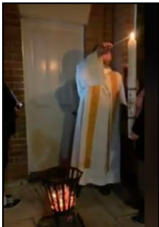
Lighting of Paschal Candle