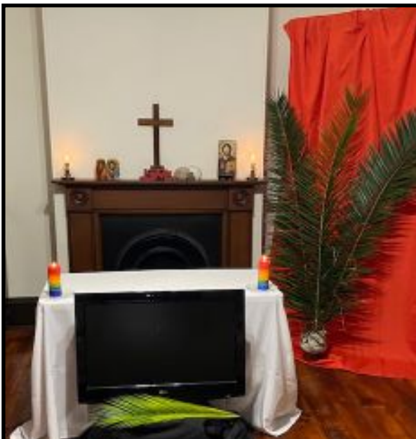
The Rectory set up for Live Streaming on Palm Sunday