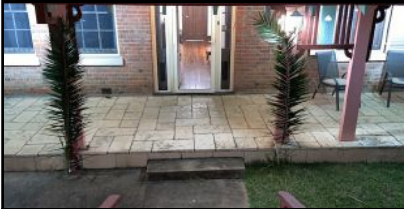
The Rectory on Palm Sunday