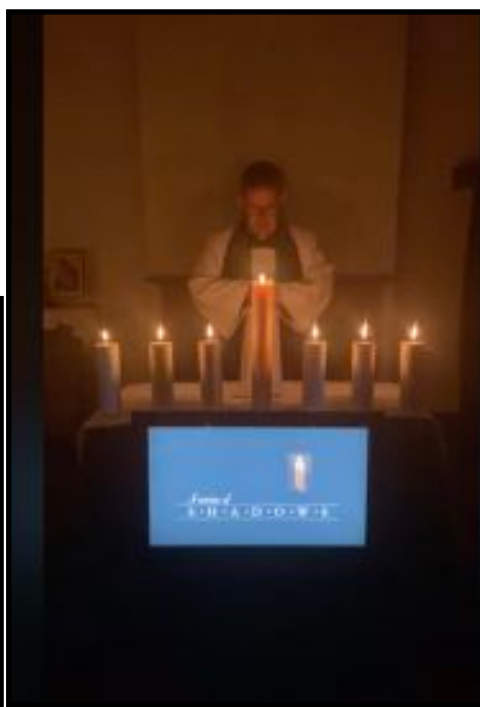
Online Streaming Service of Tenebrae