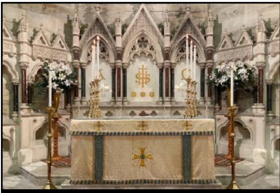
The Sanctuary on Easter Sunday