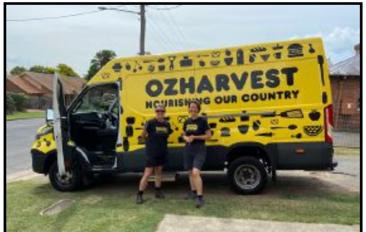
We are very grateful to OzHarvest who continue to deliver food for us to distribute to the needy