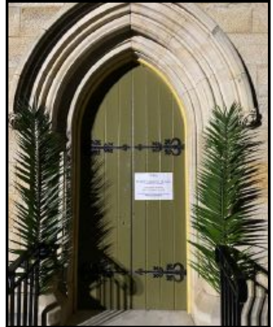
Doors closed on Palm Sunday but the Palms are there to remind us