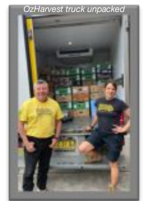
OzHarvest truck unpacked

UNPACK Wednesday and Oz Harvest deliver the bulk of the food and the team are ready on hand to unpack the truck. This has been an important partnership but with the increased number of families needing help we have noticed a reduction in the supply of the goods that we receive as the food needs to go further across the community.