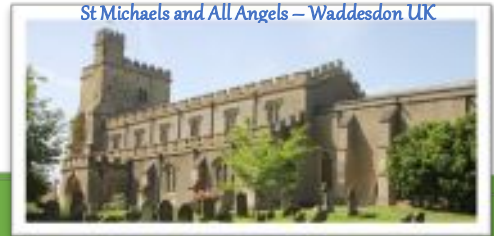
St Michaels and All Angels - Waddesdon UK

What about the copper and lead? Approximately 160 metres of copper gutters and flashings underneath 40 metres of copper downpipes. Each dormer consists of 25 handmade custom pieces of copper. 100 metres of copper ridge and hip capping plus around 3 tonnes of lead.