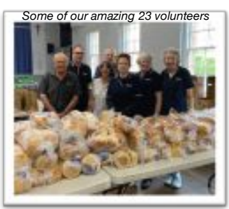
Some of our amazing 23 volunteers

The Pantry team cannot thank the parishioners of St Peter's enough for the support you give them every week. Without it we would not be able to continue the work we do with all of the families needing help. Christmas is just around the corner and with the ever-growing number of families you can be assured that your pantry team, with your help, will be doing their best!