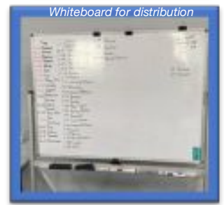
Whiteboard for distribution

DISTRIBUTE Clients are listed on the whiteboard and are assigned a time for collection. They are greeted at the Hall window by our friendly 'front of house' team who hand over their parcel with a kind word, a smile and a 'see you next week' wave.