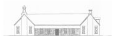
Elevation and plan of St Peter's denominational school, East Maitland, with master's residence and attic rooms overlaid facing Banks Street

A number of clues led to the discovery of historical letters in the NSW State Archives which prove that the building now used as a Parish Hall was built as a denominational school in 1867-68. The reason why the letters existed at all was to justify a grant of £400 of public money towards the anticipated cost of £1200 for building the school.