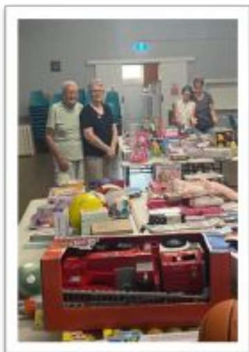
The team setup donated toys for inclusion into the Christmas hampers