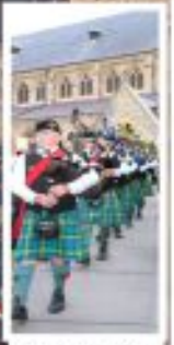
Maitland Pipes and Drums

FREE ENTRY Market stalls, sausage sizzle, soft drinks, ice cream & coffee van from 4pm. Please bring a rug or chair. This is a family friendly alcohol-free event