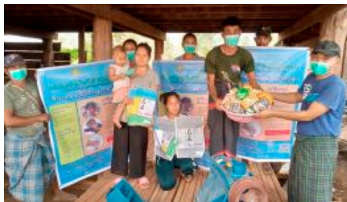
CPM development project staff distributing COVID-19 prevention posters and hygiene kits in a Hpa-an village, Myanmar.

You can phone 1300 302663, Sydney 02 9264 1021 or email info@abmission.org.au