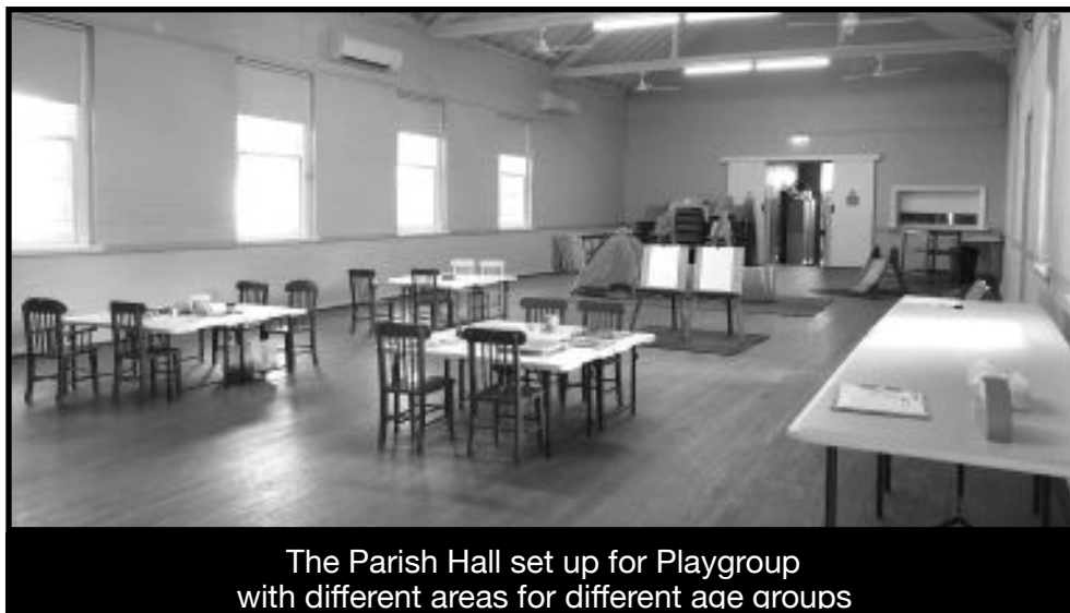
The Parish Hall set up for Playgroup with different areas for different age groups

I am working on some new projects regarding our family ministry, so stay tuned for more information!