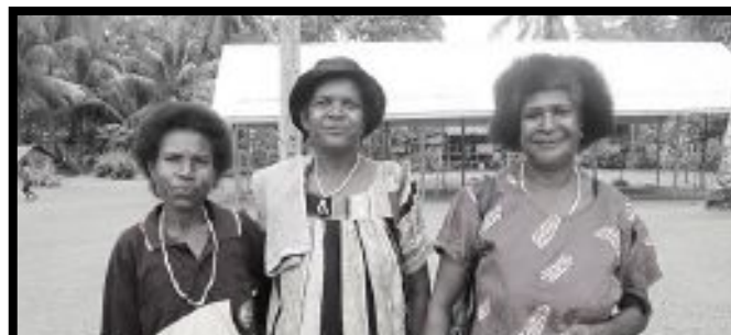
Women from Sorovi community in Popondetta,

ABM have partnered with the Anglican Church of PNG and Anglicare PNG since 2004 as part of the Church Partnership Program. The Church Partnership Program brings together seven denominations and their Australian NGO partners to work together to improve service delivery and build resilience in rural communities, with support from the Australian Government.