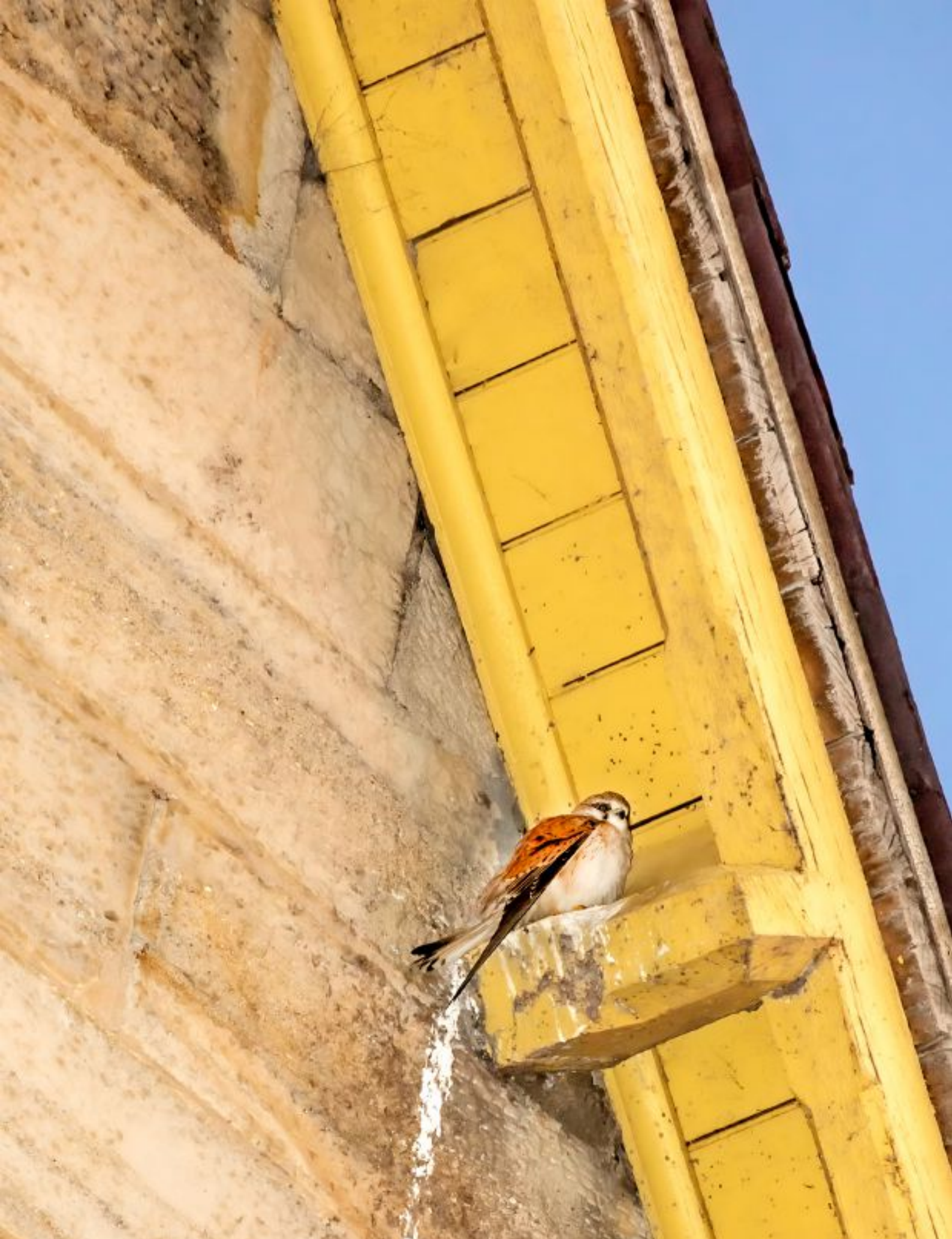
Nankeen Kestrel roosting at Western end of church