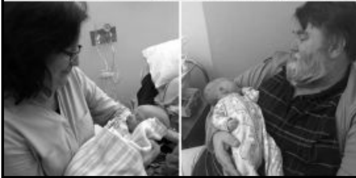
Proud grandparents having their first cuddle